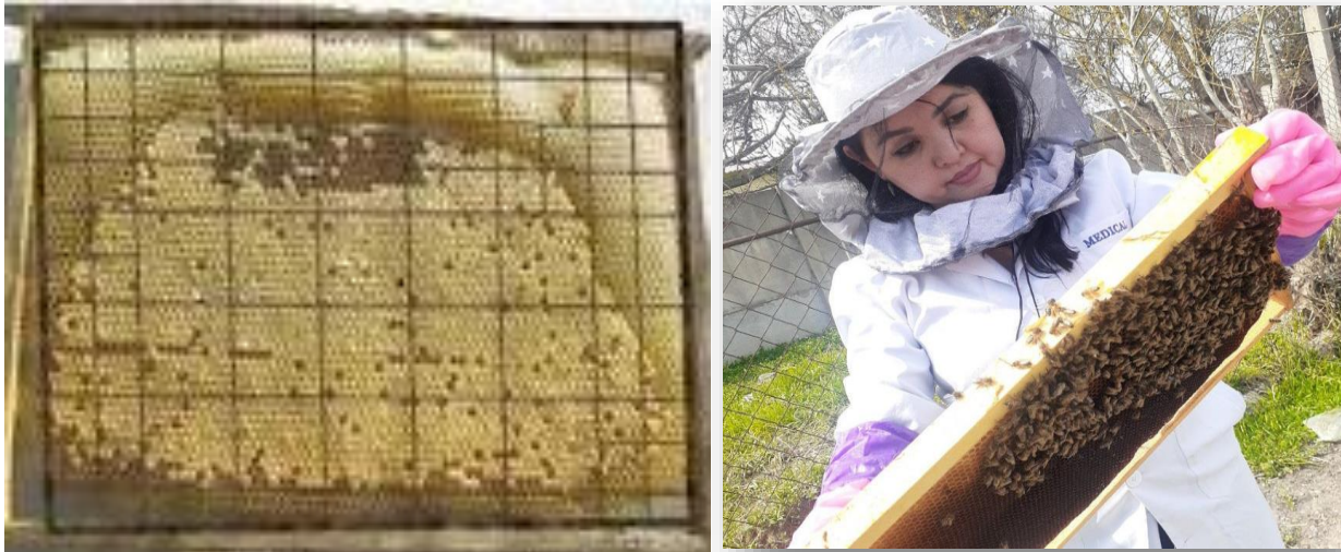
Figure 1. The process of determining the amount of offspring in the bee family.

As a result, queen bees begin to lay eggs in large numbers in the cells of male bees with such enlarged mouths. This situation is observed more often in families that tend to separate the queen bees. This is the main sign of the migration of the bee family.