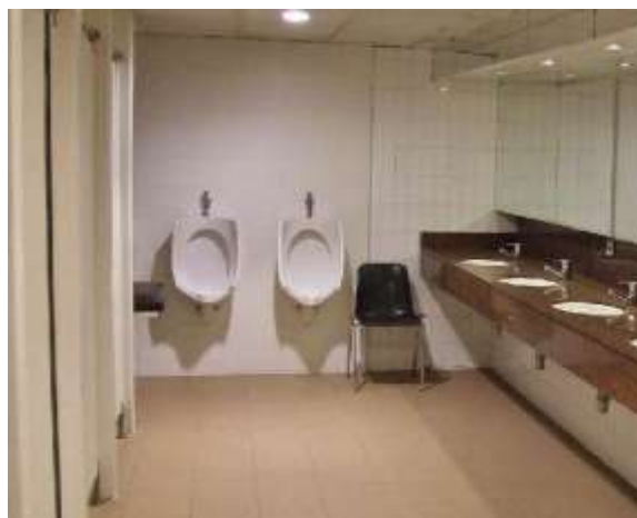
Figure 1. Methods of using atmospheric rainwater for secondary purposes

The mechanical cleaning method removes undissolved and partially colloidal impurities from wastewater. First, large waste: rags, paper, animal and vegetable waste, etc. will hold. The main mass of impurities is in the form of minerals, and those whose gravity is greater than the gravity of water are sand, stones and other mineral substances. Then the floating, sedimenting and organic matter in the wastewater is captured, that is, the mechanical sedimentation of suspended floating suspended and partially organic matter is captured. Basically, this method is put before biological, physico-chemical and chemical cleaning methods. In general, the mechanical treatment method is a method of pre-treatment of wastewater.