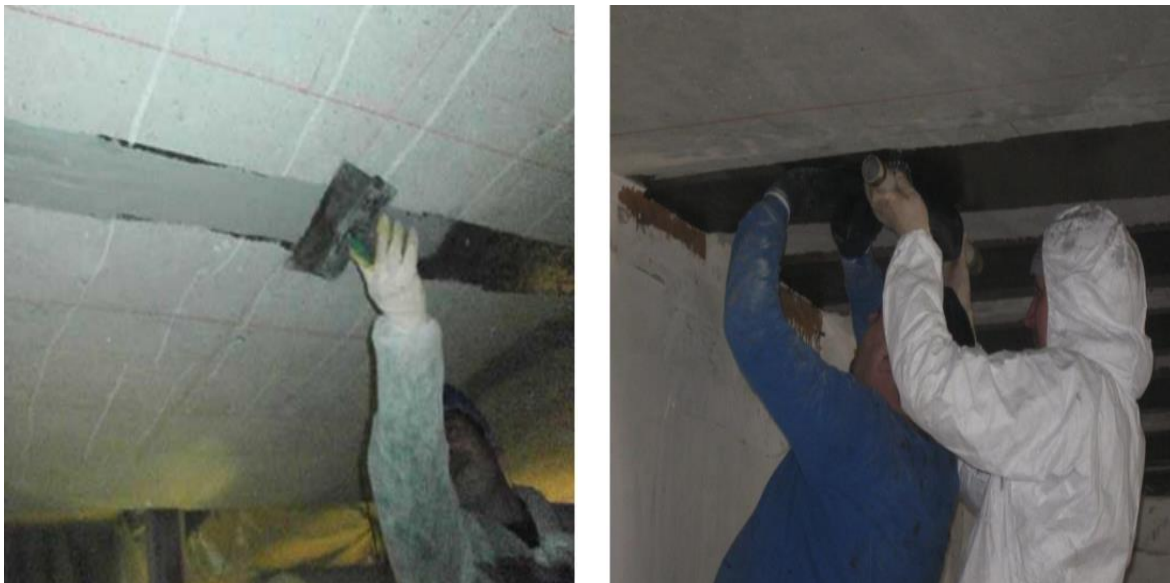
Figure 2. Bonding process of carbon fiber fabric

A 60 mm carbon fiber fabric is attached to the plate in a 500 mm step. 3 rows of carbon fiber fabric are glued in the longitudinal direction of the plate.